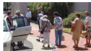
Braeside Seniors Friendship Group, off to the Auburn Botanic Gardens.

"Our group have a strong sense of community too, and in planning their activities want to contribute themselves. The sort of charity work discussed included making things for potential sale to assist issues with local youth on the streets. There has even been talk about knitting and making up squares for woollen wraps for the 'Wrapped with Love' campaign."