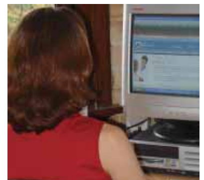
Search on-line for jobs at our careers website www.hopehealthcarecareers.com.au